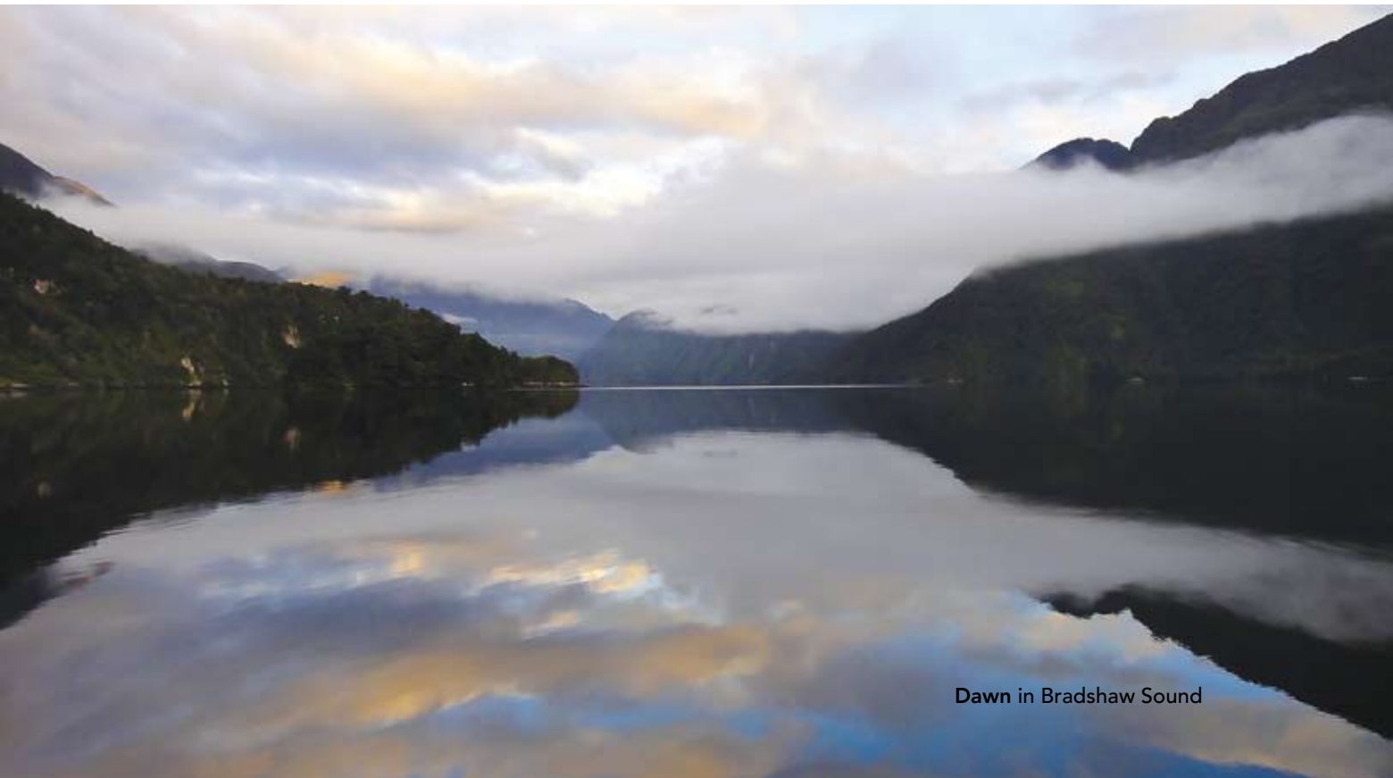
Dawn in Bradshaw Sound

Once the anchor was set, we eased the kayak overboard. In a move that would become familiar, I paddled a line out from the most vulnerable side to secure the stern. Then I returned and got a second line from the opposite side, paddled it out, and secured it. Here, as in several places in Fiordland, a line was strung across the narrow cove. I simply tied through loops in it. Later, in different anchorages, I would have to tie the lines to trees ashore. At low water we hopped into the kayak for a paddle to explore the shoreline. Even then it was possible to paddle right next to the steep walls and overhanging vegetation. Around one bend we found heaps of mussels hanging from a partially submerged limb. Guess what was for dinner that night?