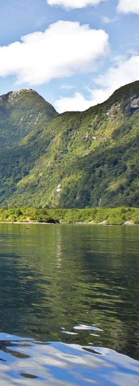
Anchored at the head of Doubtful Sound, South Island, New Zealand