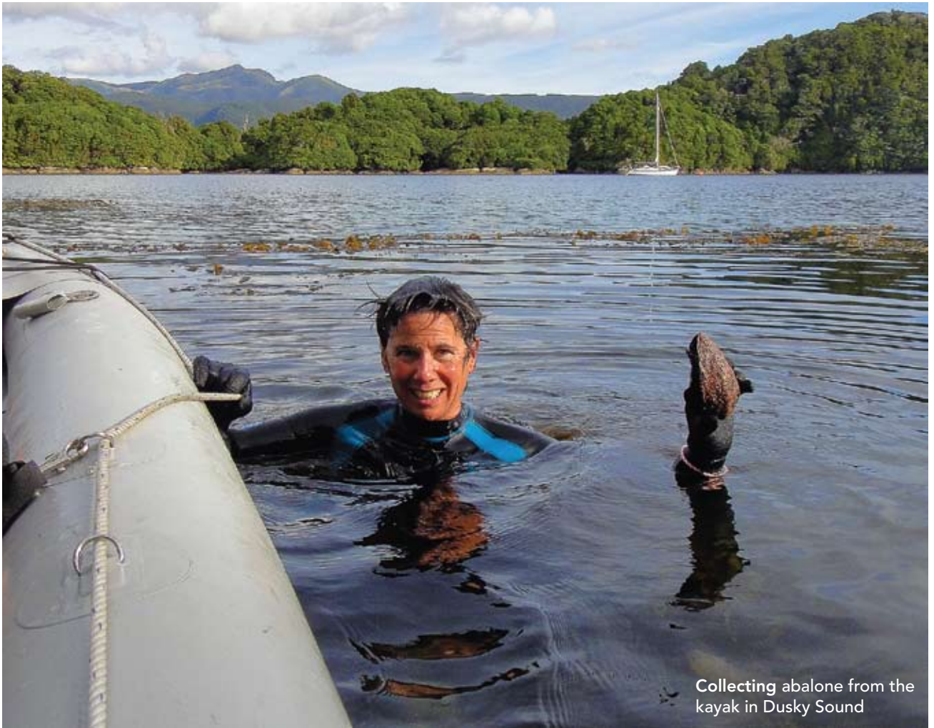
Collecting abalone from the kayak in Dusky Sound