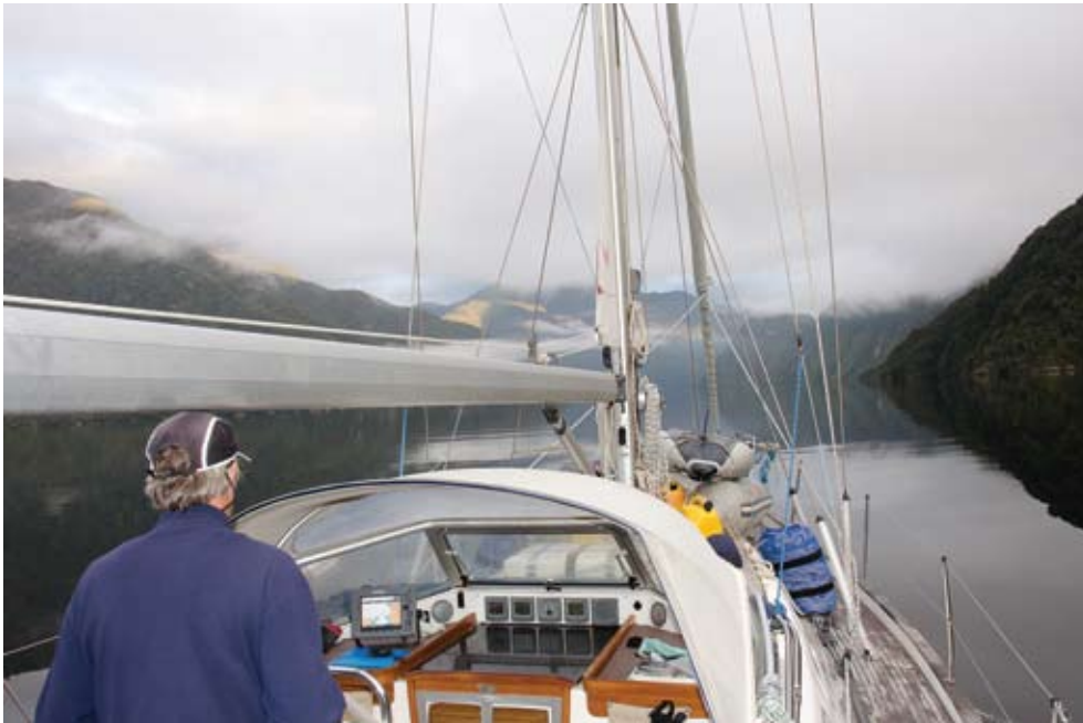
Early morning at the head of George Sound

The reflections of the mountains and early morning sky on the glassy water were surreal as we slowly eased out of the anchorage the next morning. Thinking that life could not be any better, something splashed in the distance. Dolphins were coming to visit! They frolicked at the bow for half an hour, darting back and forth, gliding close to the surface and arching out of the water. From my perch on the bow I cooed and cajoled as they passed, often looking up at me. A juvenile was especially endearing. Numerous times it rolled over to reveal a white belly and several times rubbed its small body on the bow while drifting on its back. The inquisitive creatures only left when the water began to ripple.