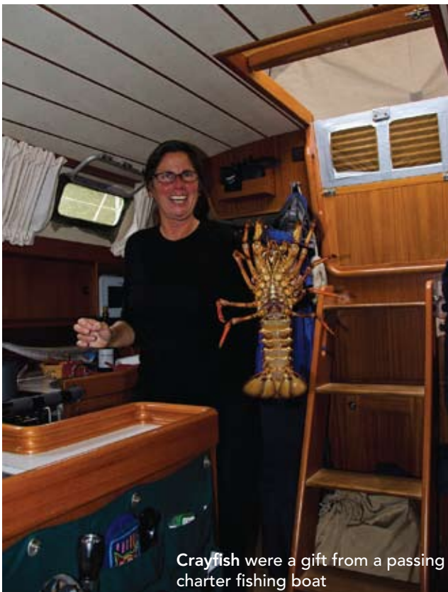
Crayfish were a gift from a passing charter fishing boat